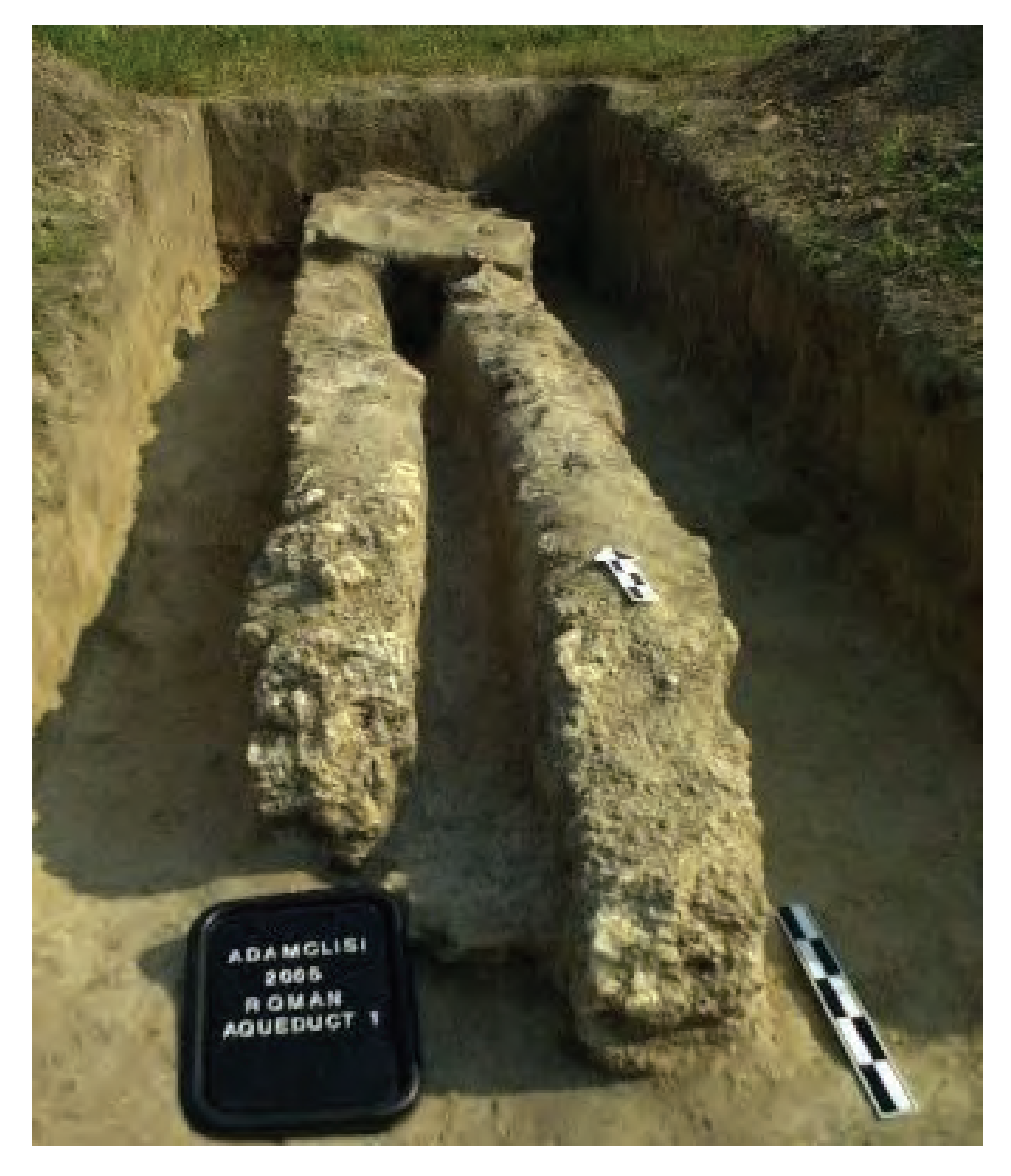
Fig. 1. Adamclisi. Aqueduct excavated in 2005.